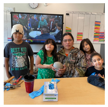
Rattle-making in Kitchenuhmaykoosib Inninuwug