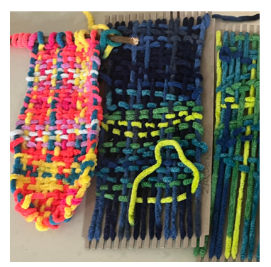
Weaving in Big Grassy FN