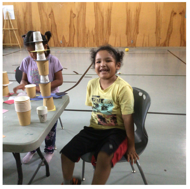
Building a tower in Slate Falls FN