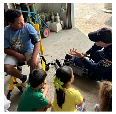
Learning about vital signs from a paramedic in Whitesand FN