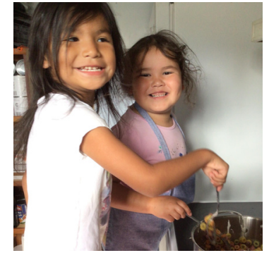
Making a snack in Slate Falls FN

In addition to these valuable contributions to camp programming, we counted 385 visits from parents, caregivers, and others in the community who came to read a book, play a game, or just observe. Their presence helped celebrate campers' achievements and make each camp a unique experience.