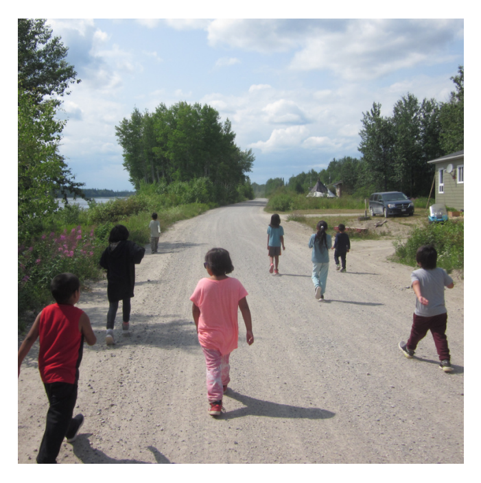
On a nature walk in Marten Falls FN

Fun and engaging camp activities included daily group and individual reading, literacy games, science experiments, outdoor exploring and learning about the community, field trips, visits from Elders and community members—and more!