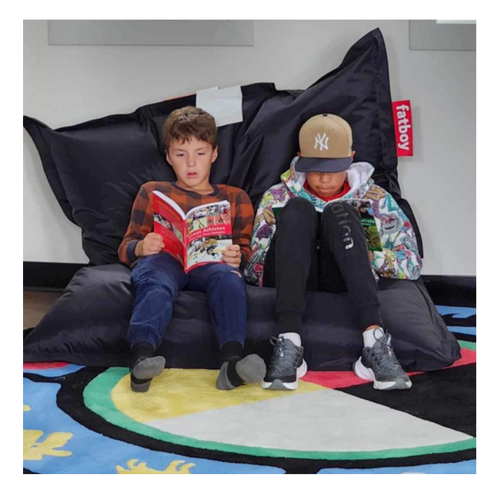
Campers in Onigaming FN reading together

These one-day camps provided fun, literacy-based activities and book donations. Based on the success of the pop-up camps, we hope to offer full Summer Literacy Camp programming in Greenstone next year!