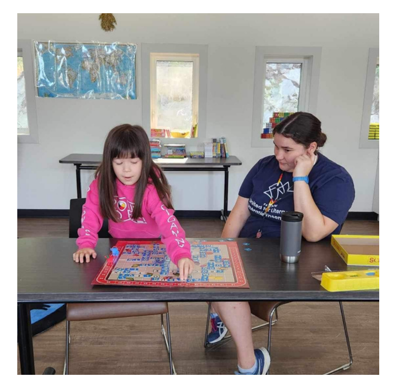
A game of Scrabble in Onigaming FN

3 Government of Canada. (2022, March 23). Youth unemployment in Canada, Germany, Ireland, and the United Kingdom in times of COVID-19. Retrieved from Statistics Canada: https://www150.statcan.gc.ca/n1/pub/36-28-0001/2022003/article/00003-eng.htm